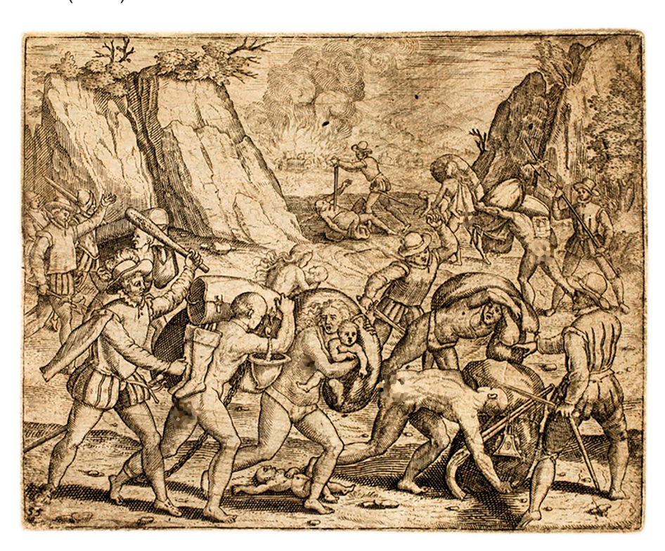
End of prescribed subject 2

Johann Theodor de Bry, an engraver, depicts a scene from 16th century Mexico (1598).