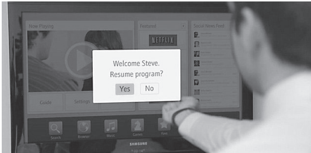
Figure 3: LOKI user authentication

The LOKI also contains sensors that tell a device, such as your cell/mobile phone, how far away you are from it, and lock it if you are not holding it. However, once you are holding the cellphone the LOKI can unlock it without a password. Some LOKI users are considering using it to control all the devices in their smart homes, such as their lighting, heating and other electrical devices.