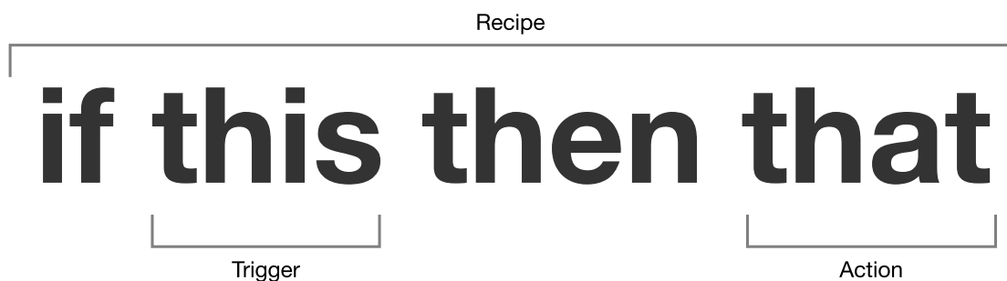
Figure 2 – Example of a rules-based programming system

40 Some of the above could be achieved using a simple rules-based programming system, such as IFTTT ( Figure 2 ).