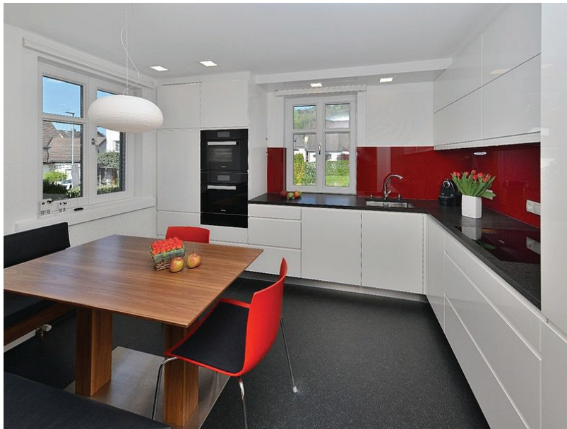
Figure 1: Kitchen counter