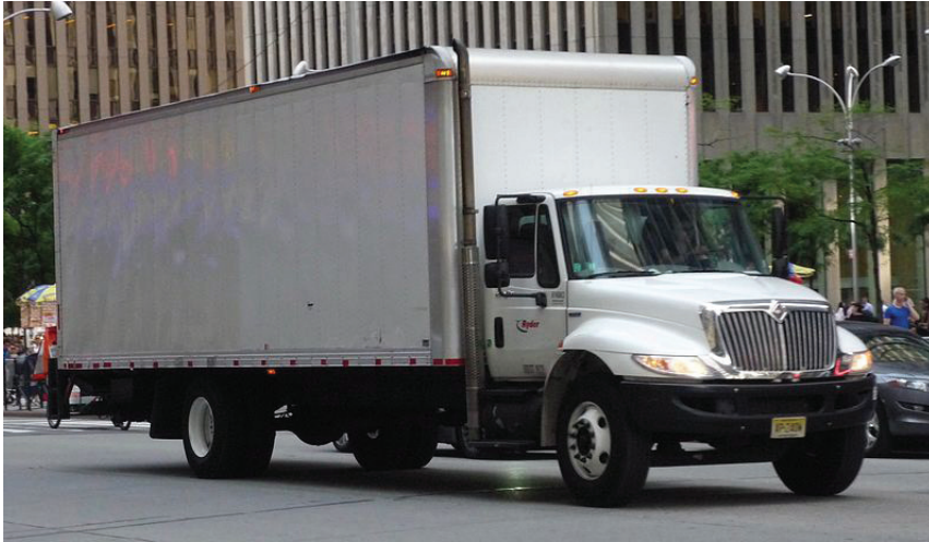
Figure 3: Large truck braking system