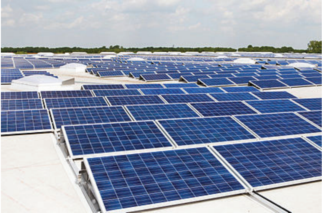
Figure 7: Solar panels