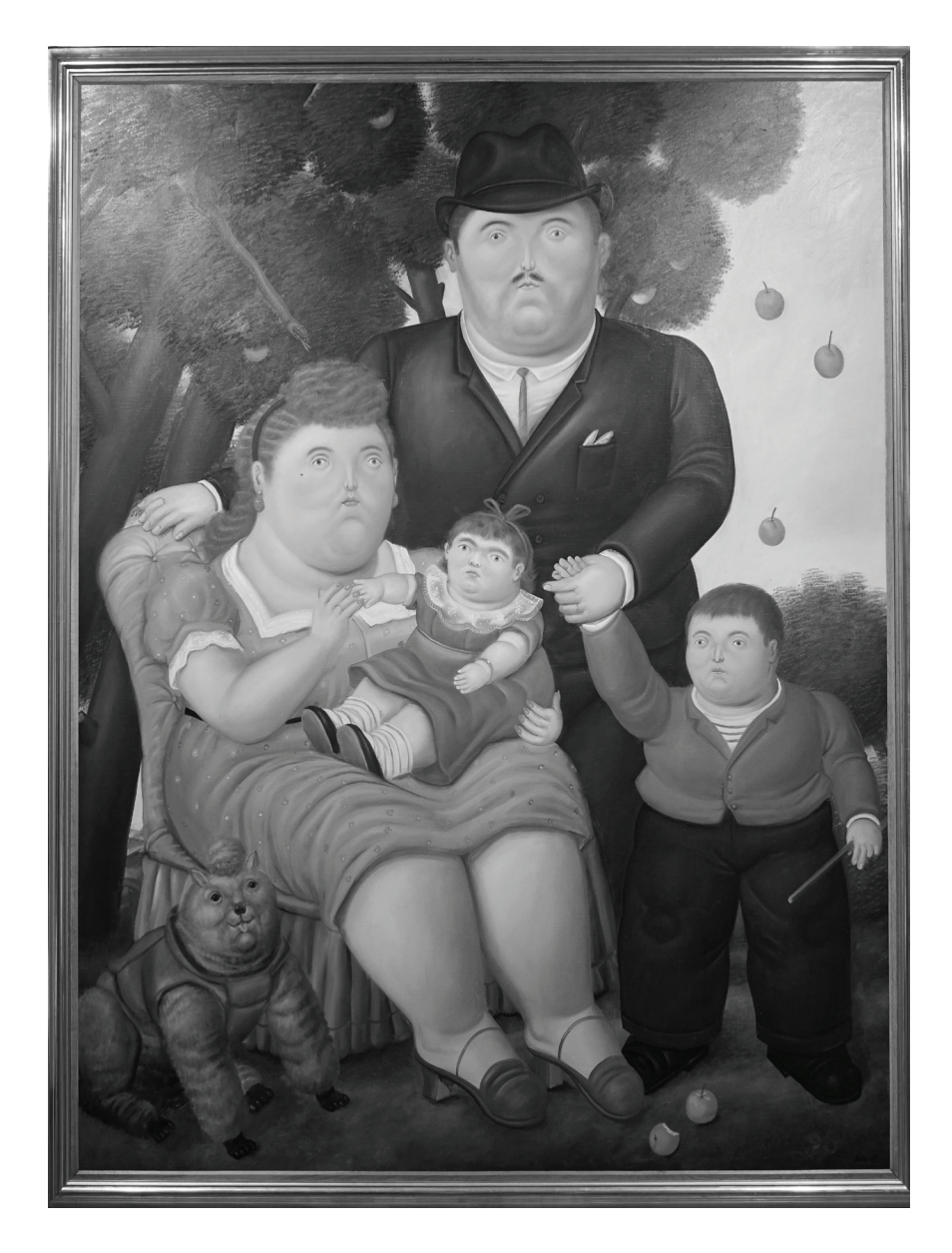
[Source: "Una familia" (A family), 1989, Fernando Botero, Museo Botero, Bogota, Cundinamarca, Colombia.]

2. Look at the following image and develop your response as indicated below.