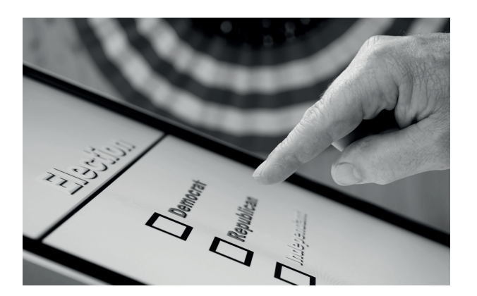
Figure 4: Example of an electronic voting machine (EVM)

The graphical user interface (GUI) of the EVM can be adjusted for different voters. For example, the font size can be increased for voters who have limited vision.