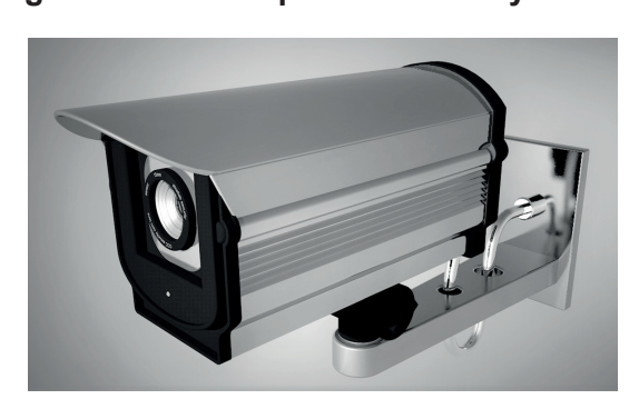
Figure 2: An example of a security camera

The field of AI is developing rapidly, and is being transformed by machine learning using neural networks. AI Security Innovations wants to link the cameras to an AI system that can distinguish between something innocent, such as a child playing with a toy gun, and a crime, such as shoplifting (see Figure 2 ). These AI security cameras will be designed to make the decision about whether to intervene or not. This could include "locking down" the premises to secure all exits so that the suspect cannot escape, or sending an alert in real time to the police.