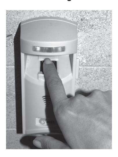
Figure 1: An employee using biometric authorization to access the office at Bright Creativa