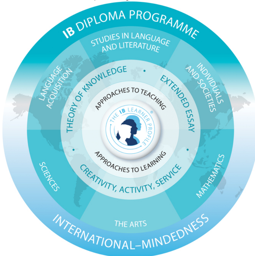
Diploma Programme model