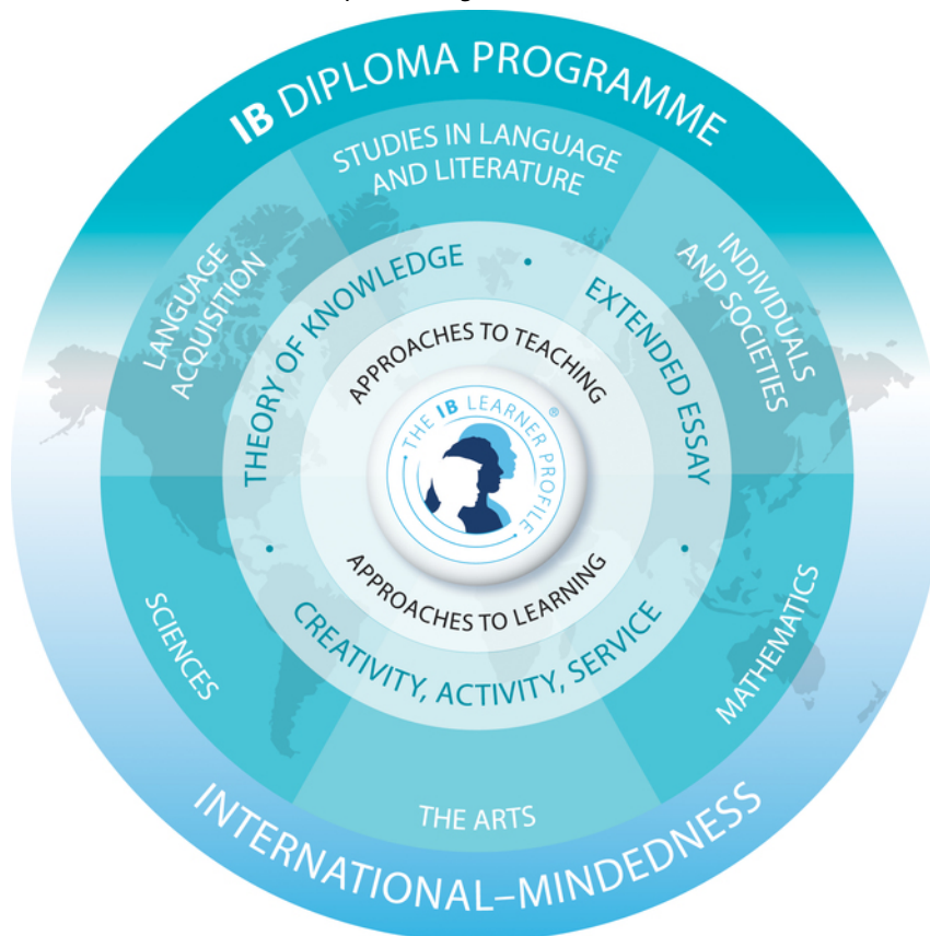
Diploma Programme model