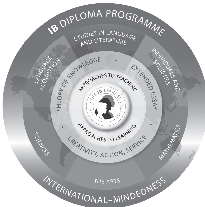
Figure 1 Diploma Programme model

The course is presented as six academic areas enclosing a central core (see figure 1). It encourages the concurrent study of a broad range of academic areas. Students study: two modern languages (or a modern language and a classical language), a humanities or social science subject, an experimental science, mathematics and one of the creative arts. It is this comprehensive range of subjects that makes the Diploma Programme a demanding course of study designed to prepare students effectively for university entrance. In each of the academic areas students have flexibility in making their choices, which means they can choose subjects that particularly interest them and that they may wish to study further at university.